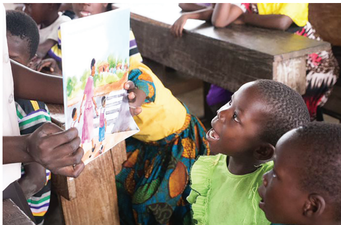
Classroom reading lesson

Most guidance to the SRCF is provided by the 'mother' primary school rather than any additional structure developed by EQUIP-Tanzania. Overall oversight is also provided by existing professional cadres within local government.