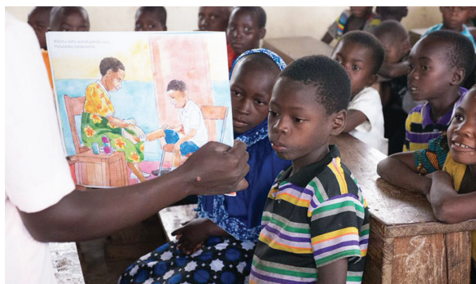
Classroom reading lesson

have been enrolled in more than 3,000 SRP centres since pilot in 2015